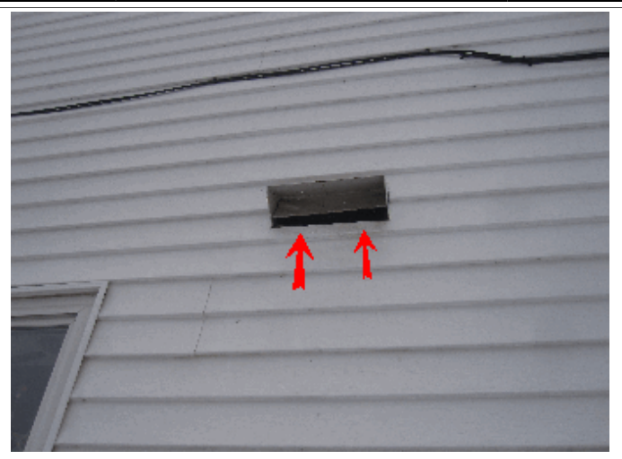
Exterior: Vent on exterior is ???? Needs to be sealed to prevent critters from entering house.