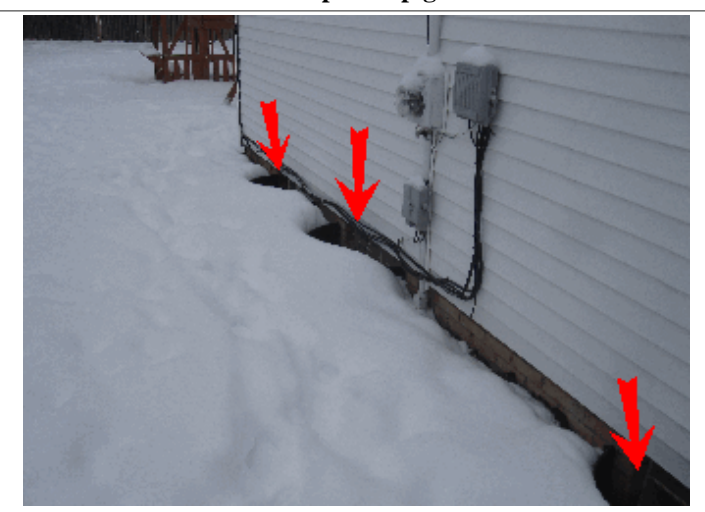
Exterior: Recommend window well covers for basement windows.