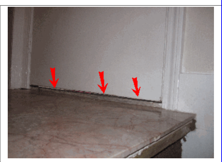
Garage entry door weather stripping is missing.