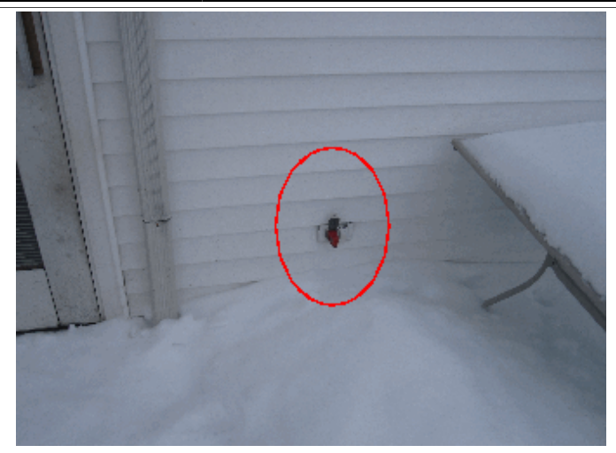
Elect.: Need GFCi outlet on exterior.

ONLY FOR USE BY Your Name , North Olmsted, OH