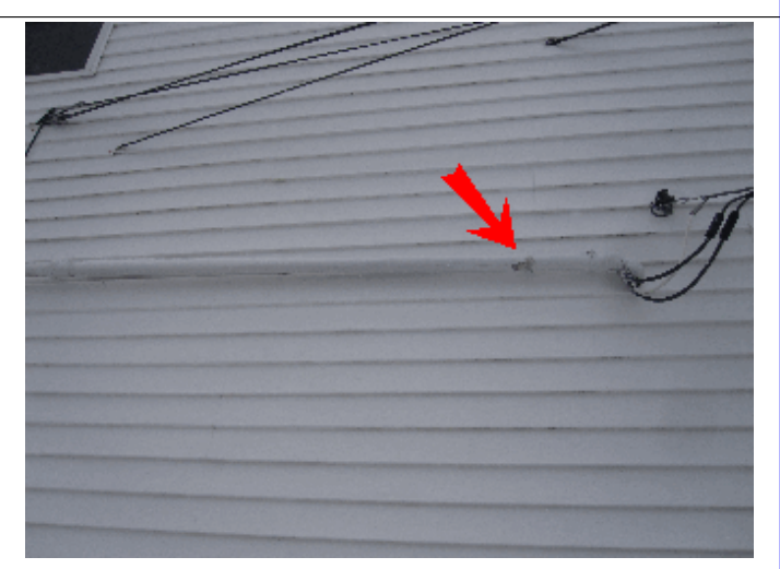
Main electrical mast needs secured to house.

Service type Main disconnect Overhead 100 AMP Wire type(s) Main panel BX (armored), Romex Basement