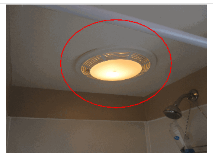
Both upstairs bath vents are noisy.

#1 Floor covering Plastic sheet Tub/shower wall Plastic or fiberglass Power fan Vent method