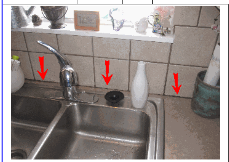
Caulk around kitchen backsplash. Open gap needs to be sealed.