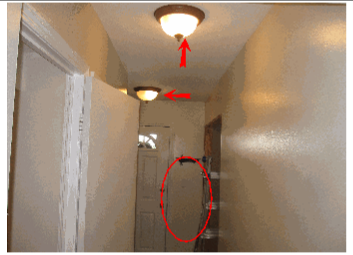
Elect.: Make sure to use appropriate dimmable bulbs for any dimmable switch light.