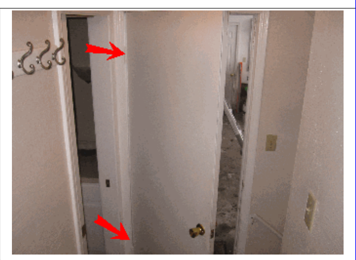
Kitchen garage entry door needs to be an auto- closure for safety/fire hazard.

Appliances Stovetop, Microwave, Dishwasher, Oven,