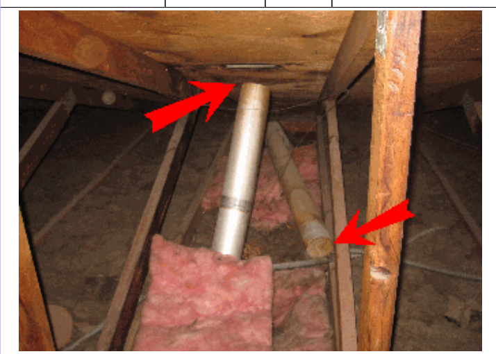
Both upstairs bathroom vents exhaust into attic. Need to exhaust outside for health safety.