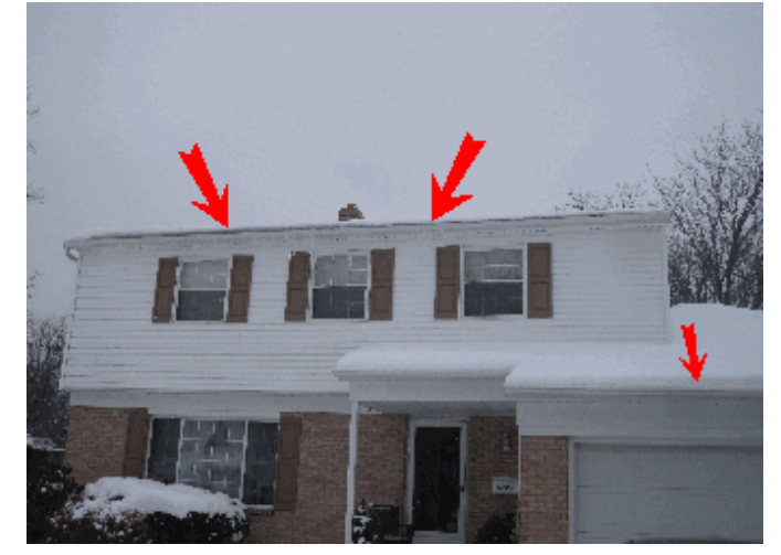
Gutters are sagging. Need to be leveled to prevent water from running over onto foundation.