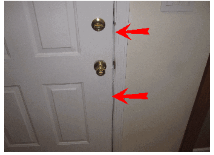
Front door weather stripping is open.