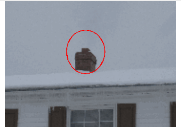
Rain cap/Spark arrestor is needed on BOTH chimneys.

Roof viewed from Ground Type of roof Roof covering Siding type Gable Asphalt Vinyl