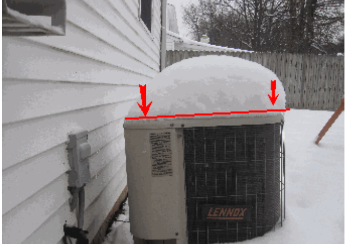
AC unit needs leveled for proper operation.

Type of system Complete system Type of fuel Air cond. Forced Air Furnace with AC Gas Central