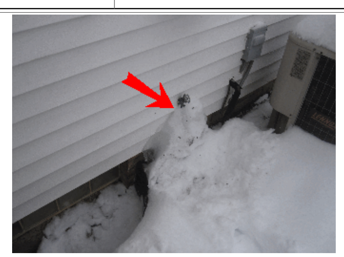
Exterior: Spigot is leaking and freezing. Replace with freeze proof spigot.