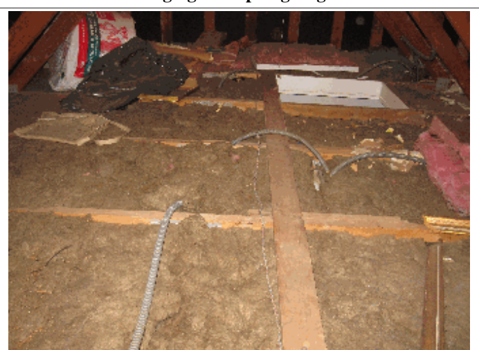
Inter: Bad attic insulation, compressed, damaged or missing.